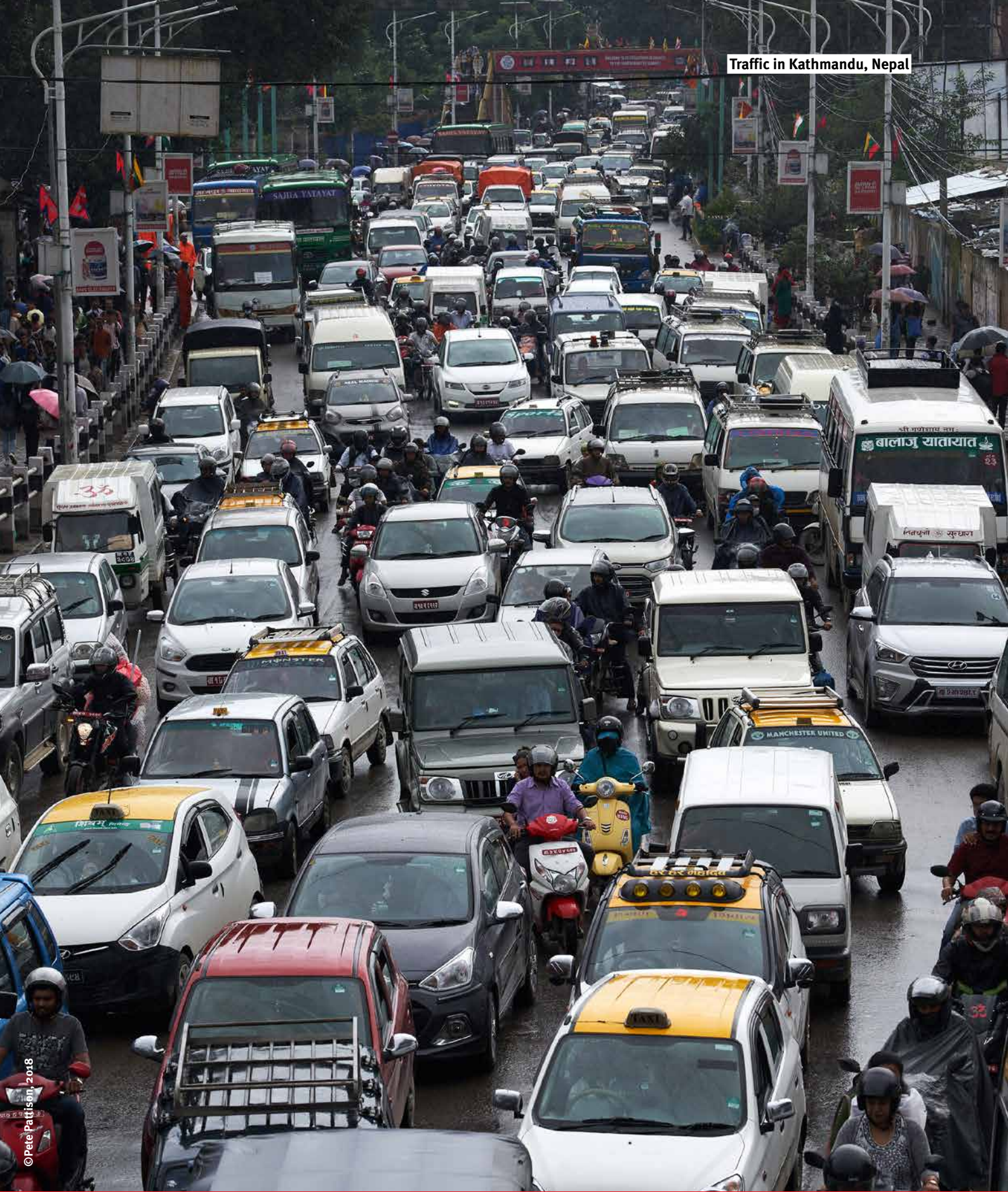
Traffic in Kathmandu, Nepal