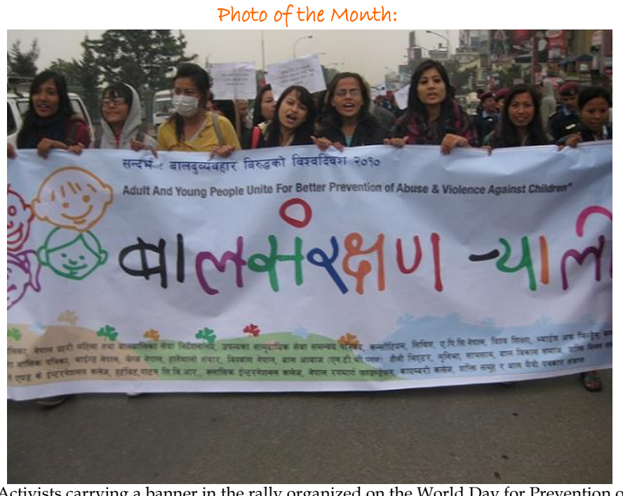
Activists carrying a banner in the rally organized on the World Day for Prevention of Child Abuse, 19th of November.

Through the active involvement of the child club networks' members the former policy was reformed in the workshop and set as the new policy of the newly formed Kathmandu Valley Level Child Club Network. Members were also selected for the human resources of the newly formed organization. Its working committee got a total of 13 members. The selections for different