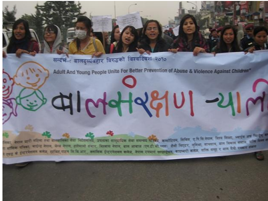
Activists carrying a banner in the rally organized on the World Day for Prevention of Child Abuse, 19 th of November.