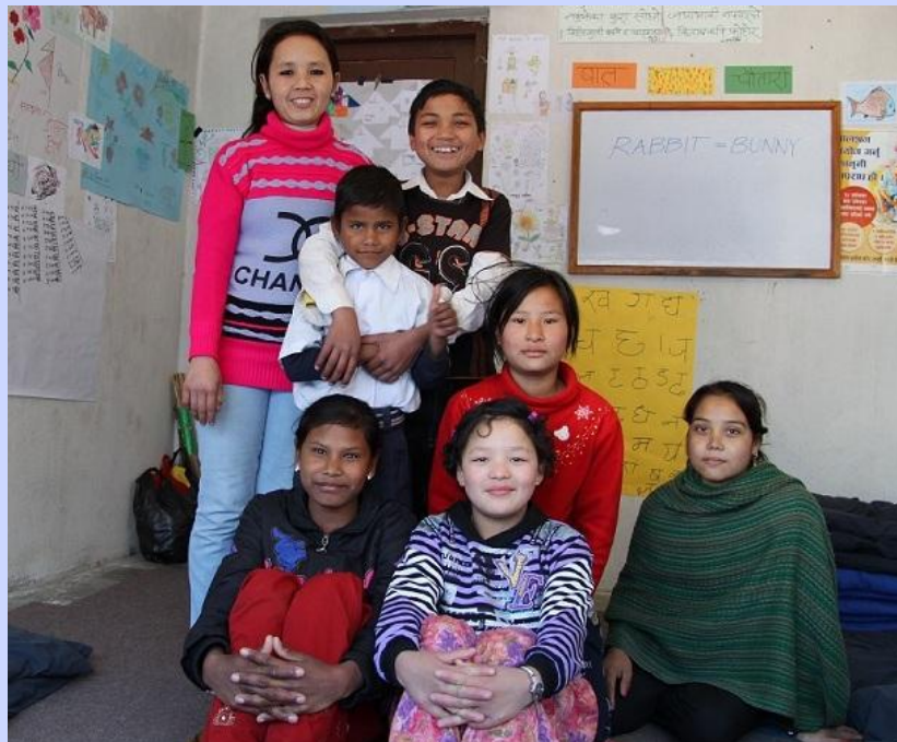
The education based Outreach Centers are important places: Basundhara ORC's pupils with their teacher.